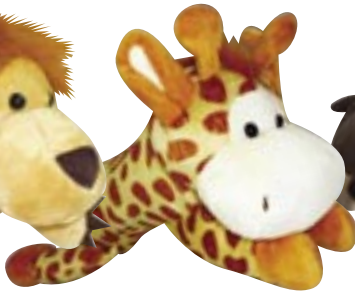
Chacha the giraffe