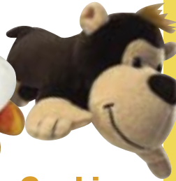
Cooki the monkey