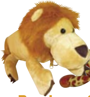
Rowdy the lion